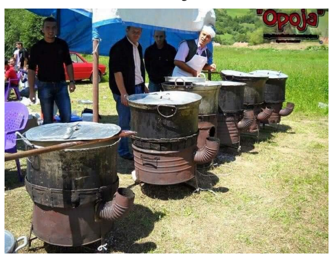
Figure 2: Traditional outdoor preparation of food for the Mawlud celebration, reflecting communal participation and classical cooking methods

After the meal, the gathering typically continues with a short lecture delivered by the imam, as participants begin preparing for the Mawlud recitation. During this time, interactive discussions often take place between the attendees and the imams, focusing on various religious topics.