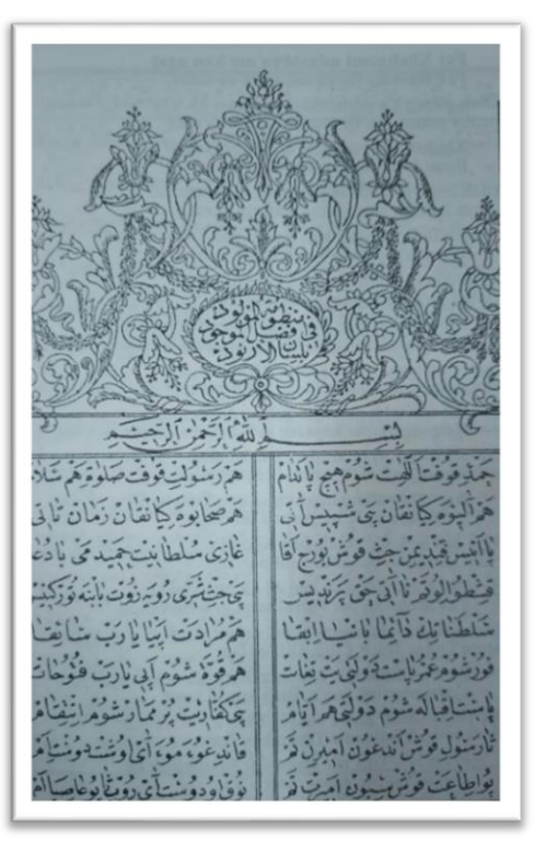
Figure 1: The facsimile of the first page of the Mawlud in the Albanian language with Arabic letters by the author, Tahir Popova/Kosovo (1907)

al-mavğûd bi lisâni al-Arnaûd (Poetry in Albanian Language about the Birth of the Best of Human Beings).