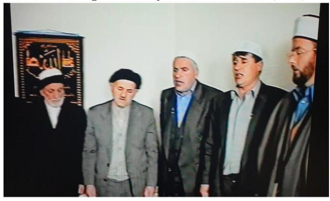
Figure 4: Recitation of the Mawlud by Imams in pairs and chorus during a ceremony in Prizren, Kosovo (2000)

Figure 5: Participants listening attentively to the recitation of the Mawlud (2000)