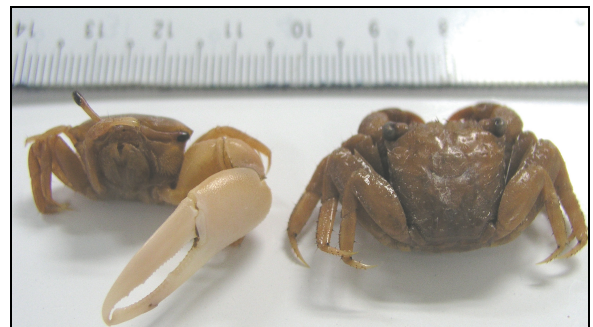
Plate 4. Uca annulipes (left) and Perisesarma sp.