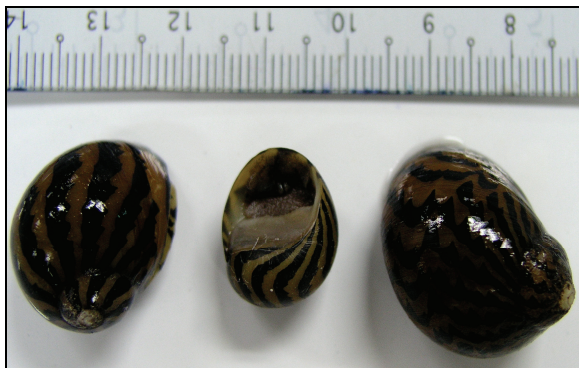
Plate 6. Specimens of Clithon aouleniensis .