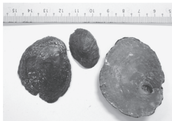
Plate 1. Dorsal (left) and ventral view (right) of saddle oyster, Enigmonia aenigmatica .

The common invertebrates were saddle oyster ( Enigmonia aenigmatica , Plate 1) and mussel Mytilus viridis (kupang). They were found growing on tree trunks of mangrove trees including Nypa fruticans found on river banks (Table 1).