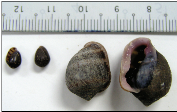
Plate 5. Pulmonates Melampus sp. (left) and Cassidula aurisfelis (right).