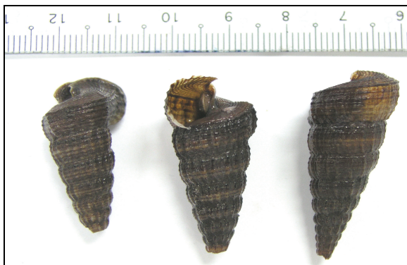
Plate 2. Cerithidea quadrata .

The mangrove fauna consisted of Sesarminae, Cerithidea quadrata (Plate 2), Neritina violacea , Fairbankia sp., Clithon aouleniensis , pulmonates Cassidula aurisfelis and Pythia scarabeus as well as the bivalve Geloina erosa (Table 1).