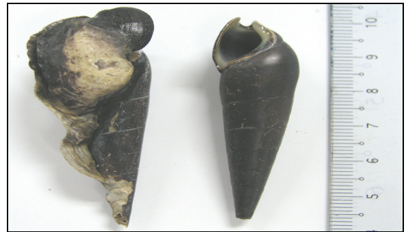
Plate 3. Specimens of the Faunus ater , left specimen with attached oyster.

The macrobenthos was dominated by the gastropod Faunus ater (Plate 3) which occurred in the thousands on the sand-mud substrate near the mangroves (Table 1). Many specimens of Faunus ater had oysters encrusted on their shells. Other invertebrates observed were Uca annulipes , Perisesarma eumolpe (Plate 4), pea crab Dotilla sp. and Cerithidea cingulata .