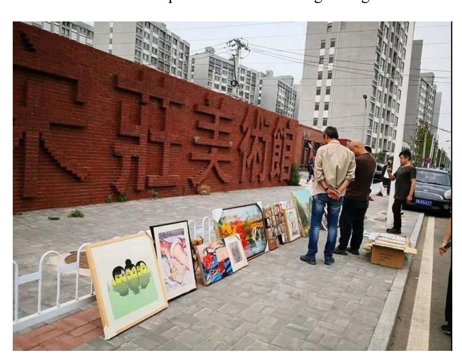
Figure 2: Photo of artists set up stalls in front of Songzhuang Art Center in 2020

campaign, with stalls set up in front of the Songzhuang Art Center as figure 2 showed. As evidenced by the documentary Heidao (means mob) Records released to YouTube, the artists' true goal was not to sell their paintings at stalls, but rather to revive the traditional Songzhuang lifestyle. Artists can be seen playing and singing by the side of the road, as well as selling their paintings and mingling with passersby.<sup>22</sup> However, after 11 days of putting up their stalls, the Songzhuang artists were pushed back by city authorities, who claimed that "the city did not have the documents to allow them to set up their stalls" (Chinaliveart, 2020).