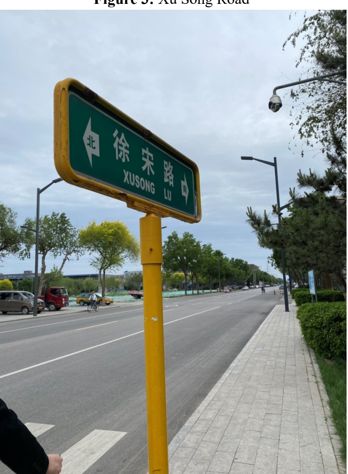
Figure 3: Xu Song Road

lots and commercial complexes to be built. Even the large landmark buildings, like Songzhuang Art Center or Sunshine International Art Museum, have few visitors. After the Covid-19 Pandemic, Songzhuang seems to have recovered relatively slowly. This may be due to the fact that Songzhuang arts village already experienced fluctuations in the art market, property disputes between artists and villagers, and the government's reorganization of Songzhuang's land layout and tightening of control over art creation long before the epidemic began. Xing Ming expressed dissatisfaction with Songzhuang art village from a spontaneously formed by artists to an art district controlled by the government, he said that "In the end, it's not fun to make it look like it's TIZHINEI (inside the system) and freelance artists won't want to stay there anymore." In the past, Songzhuang was a place where artists could start from scratch. But now, artists need to be rich or achieved something to live in Songzhuang arts village. Yao Yu, the young artist already left Songzhuang arts village for the above reason. During the interview, both Suo Tan and Wu Dewu mentioned that more and more artists like Yao Yu are leaving. Regarding the future of Songzhuang arts viilage, Wu Dewu even said, "It feels like it's over."